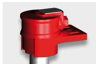
Angular Immersion Heater with HWB Support

ROTKAPPE angular immersion heaters are the ideal method of direct heating for all containers with a low liquid level or high level fluctuation. The heating of the liquid from the container bottom is achieved by the horizontal heated immersion tube and this ensures optimum heat radiation as well as good heat distribution.