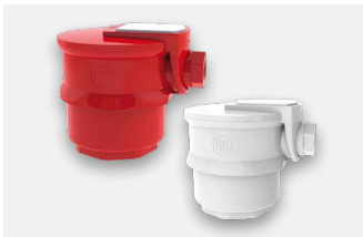
Terminal casing BC 62 (PP) and BC 62/L (PVDF); protection IP 64