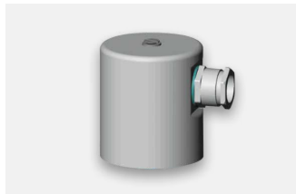
Terminal casing B (steel, zinc-plated); protection IP 64